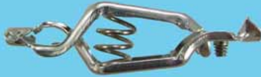
General Purpose Test Clip, Steel, 20 Amp