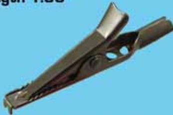
Alligator Clip, Steel, Fang Tooth with Barrel